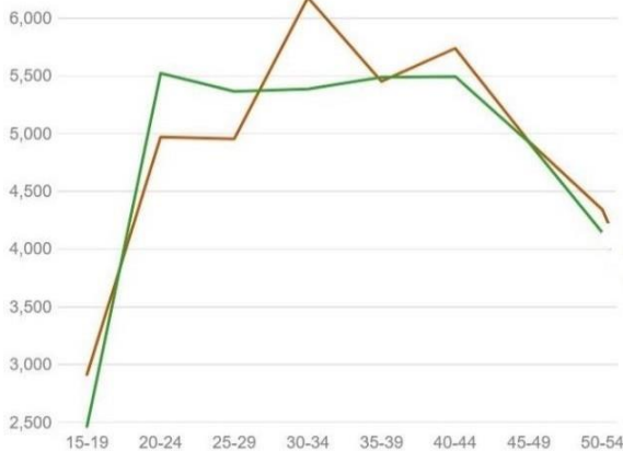
Figure 1. Targeting over PT. Befindo Food

Market segment opportunities, it must decide how many and which ones to target. Marketers are increasingly combining several variables in an effort to identify smaller, better-defined target groups. This targeting aims to make it easier to reach the segments you want to achieve and provide more satisfaction to consumers. From the results of segmentation analysis, the following are the targets of PT. Befindo Food (see Figure 1).