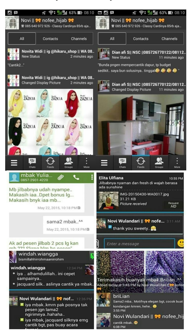
Fig. 2. Example of promoting product via BBM Service

to pay a subscription to access the internet, while the profit for the buyer, they do not have to go outside to look for things they want because all they need to do is ordering, and the goods will be sent directly to their homes. That is why many entrepreneurs who initially relied on offline stores switches to open an online shop.